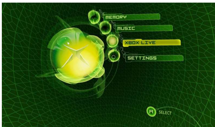
Original Xbox Dashboard.

A number of emulators exist for the Xbox, including CXBX, XQEMU, and CXBX Reloaded, but most have struggled to emulate the original Xbox OS and kernel. Microsoft developed the first Xbox with x86 hardware in mind, but the Xbox kernel was based on a custom and stripped down version of Windows 2000 with DirectX 8 support.