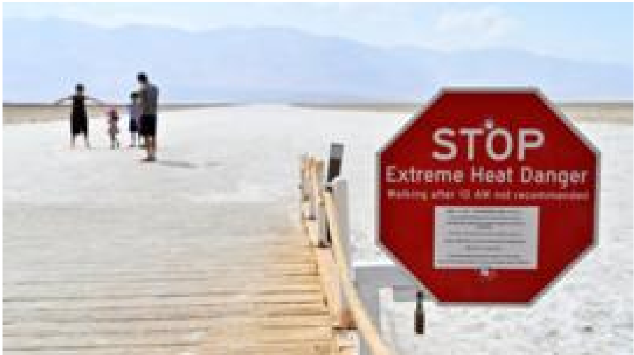
Life in the 'hottest place on Earth'