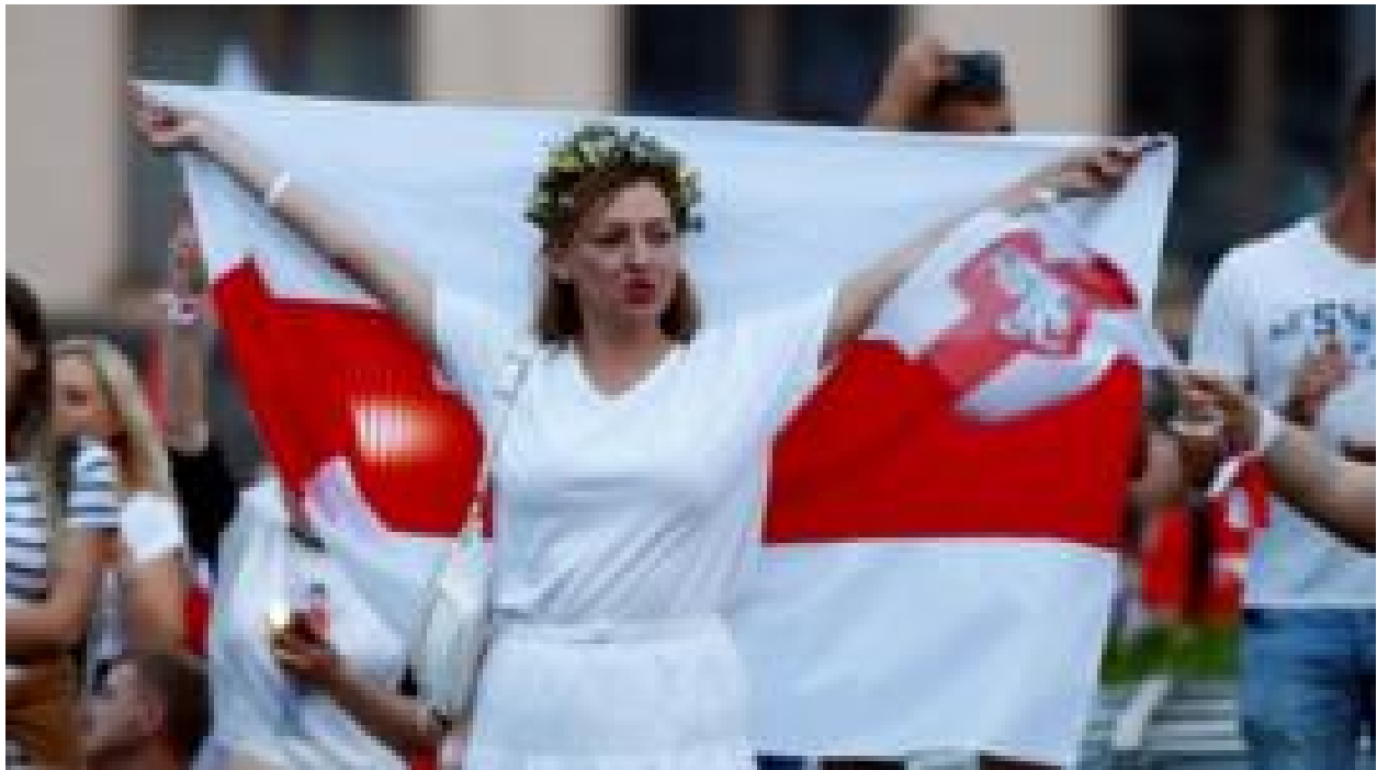
Belarus on the brink: What now?