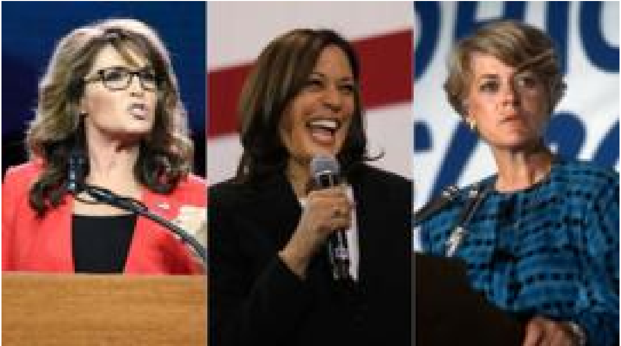
'Vice-presidents aren't cute'