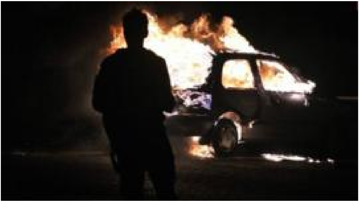
BBC Future: The unexpected link between weather and crime