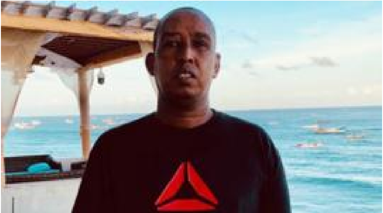
'How I survived four jihadi attacks in Somalia'