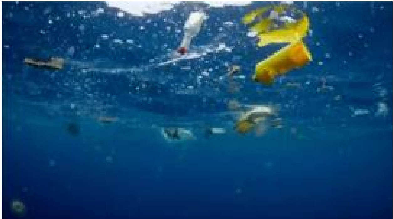
Atlantic mission finds huge amounts of microplastic