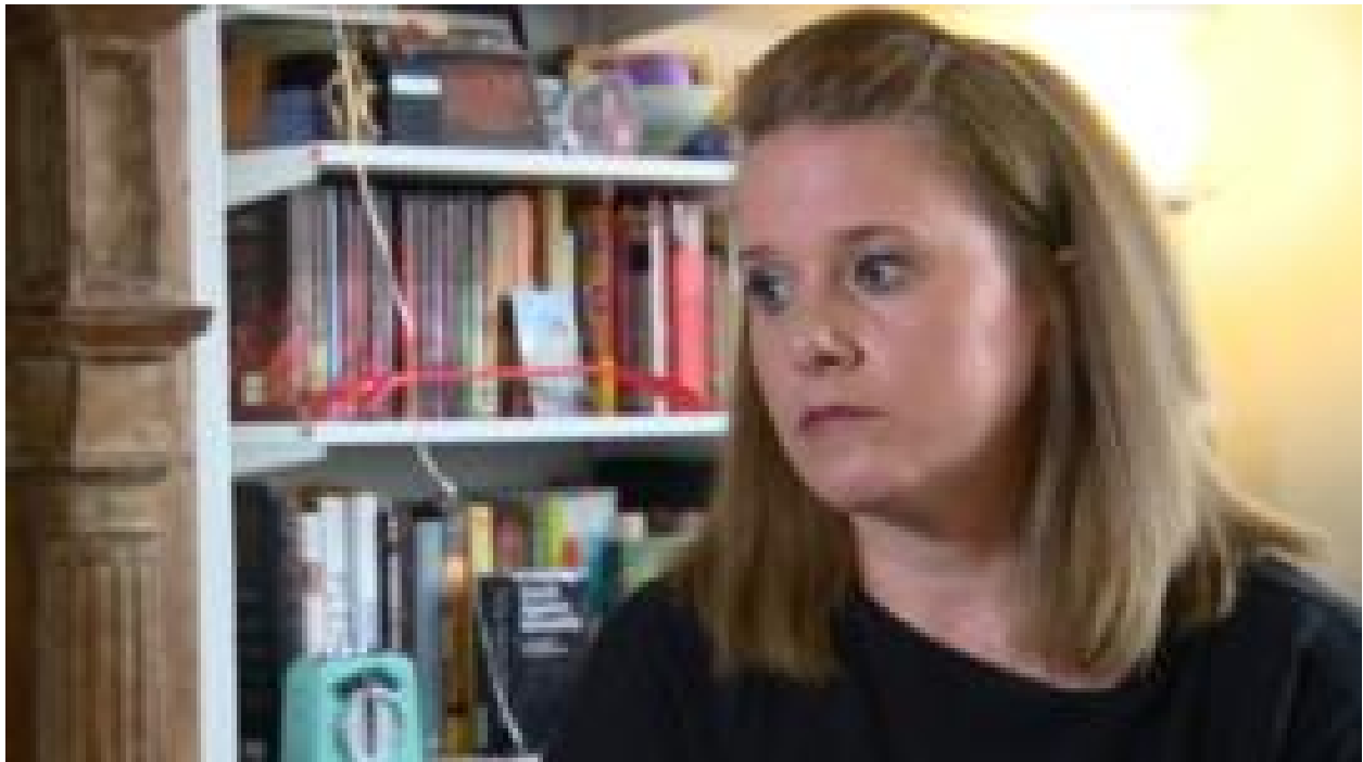
'I'll be heartbroken if Broadway doesn't return'