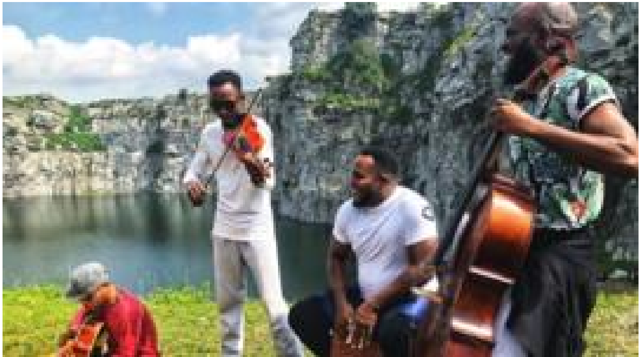
The quarry that became an internet sensation